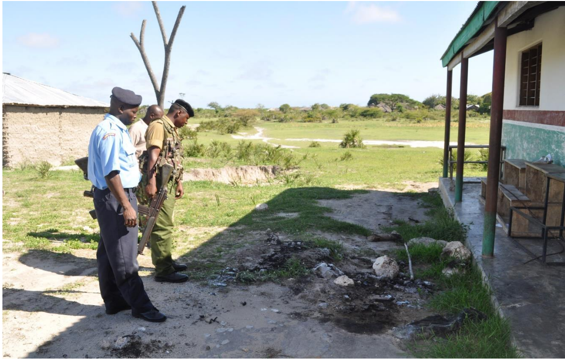
Bits and pieces of the G.K. Land Rover that was razed in Kilelengwani.

The last of the attacks between these two communities occurred on 11<sup>th</sup> September at Semikaro village in Tarassa division where it is alleged that the Ormas attacked the Pokomos and killed 4 male adults and went ahead and burnt houses at Laini, Nduru and Shirikisho villages as well as Shirikisho Primary School.