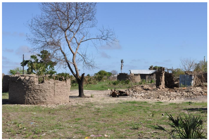
Trail of destruction in Kilelengwani village.

10<sup>th</sup> September 2012 saw another major attack in Kilelengwani where the alleged perpetrators were Pokomos against the Ormas. Witness accounts indicate that there were approximately 400 armed men who attacked Handaraku village predominantly inhabited by Ormas and killed 38 people from the Orma community and 9 Police Officers. There were 29 Ormas out of which 8 were children and 21 adults (16 male and 5 female). Over 17 people were injured and a total of 147 housed razed to the ground. It is here that the attackers took away 8 firearms and ammunition from the police officers whom they killed. A police Landrover and a lorry were burnt. Immediately after the attack, the Pokomos living in the neighbouring village fled the village for fear of retaliation.