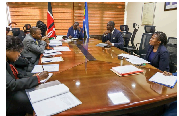
Commission holds a meeting with Hon. CPA John Mbadi, Cabinet Secretary for the National Treasury and Economic Planning, during a courtesy call

This partnership marks a crucial step towards ensuring that Kenya remains on track to meet its national and international gender equality commitments.