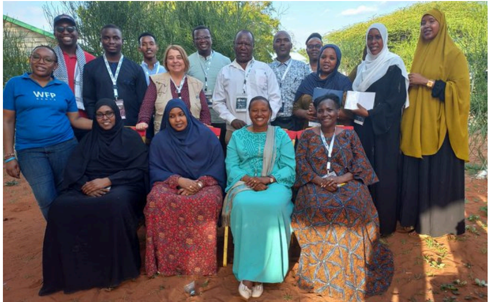
Participants pose for a group photo at the 4th Pastoralist Leadership Summit held in Wajir

The summit explored how emerging technologies, from mobile applications to digital financial platforms, can offer pastoralist communities better access to markets, healthcare, and education.