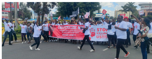
Participants marching for justice in Nakuru, united against femicide

This gathering highlighted the power of collaboration in creating lasting change, reflecting NGEN's mandate to promote inclusivity, dignity, and non-discrimination for all Kenyans.