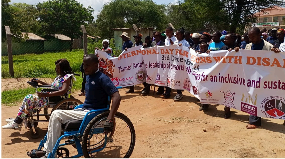
Participants march in solidarity to commemorate the International Day of Persons with Disabilities (IDPD) 2024

Kitui, Kenya – The Kitui Regional Office marked the International Day of Persons with Disabilities (IDPD) 2024 with a poignant celebration aimed at amplifying the voices of persons with disabilities (PWDs). The event, which was held in the heart of Kitui, was graced by the CECM for Gender as the Chief Guest, alongside MCAs, the DCC, and other County representatives.