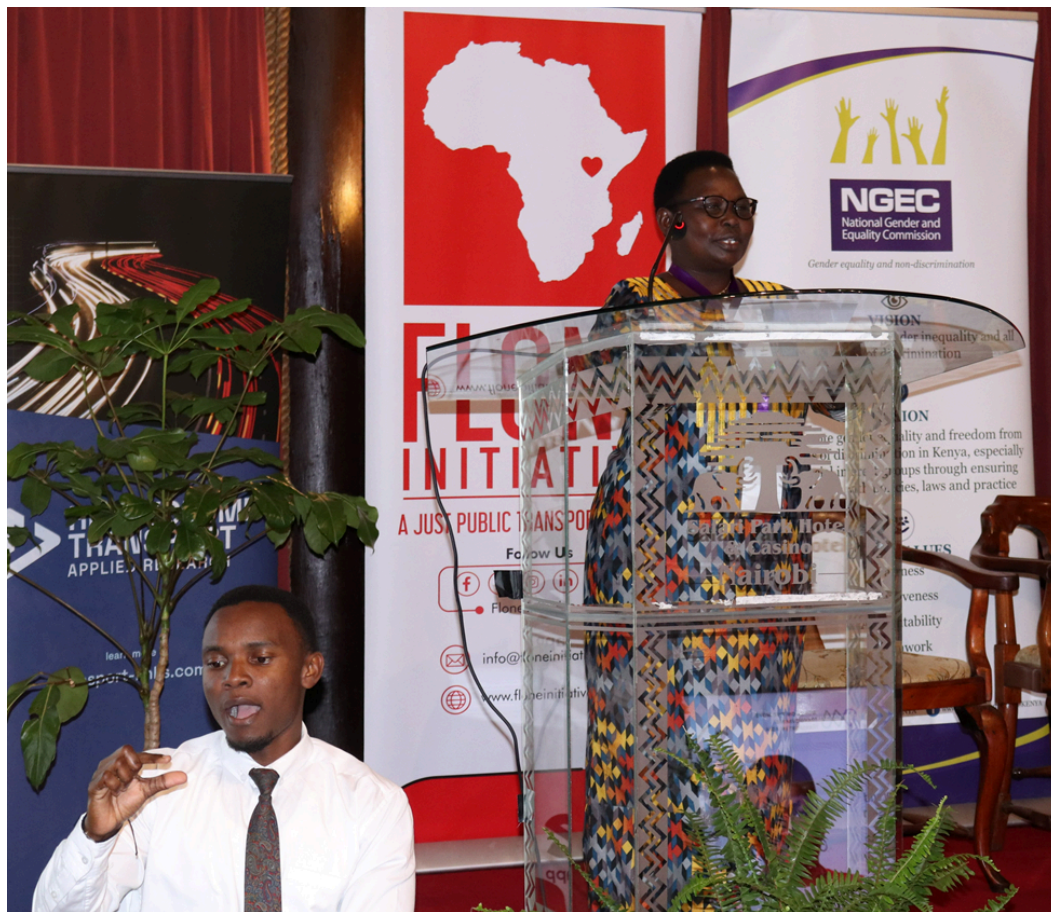
NGEK Commissioner Caroline Lentupuru delivers insightful remarks at the Women and Transport Conference 2024, Safari Park Hotel, Nairobi

The Commissioner's remarks were supported by key findings from NGEK's collaborative efforts with the Nairobi Metropolitan Area Transport Authority (NaMATA) and other stakeholders. These initiatives include gender-sensitive transport planning and anti-harassment campaigns, underscoring the pressing need for systemic reforms.