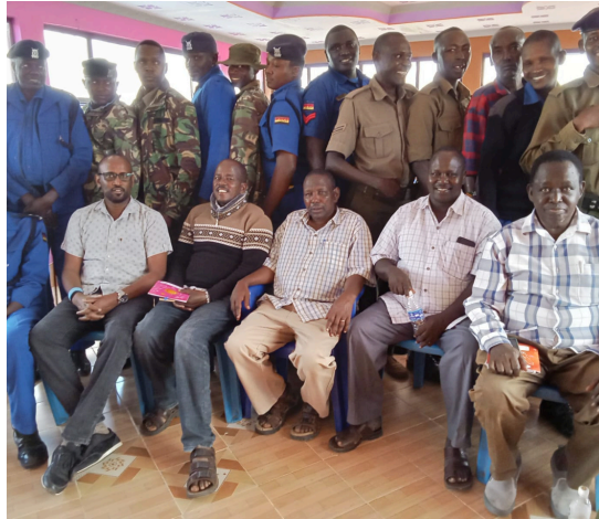
Participants pose for a group photo during the Transformative Workshop

Participants from the Kenya police, judiciary, and local administration were engaged in comprehensive training that focused on identifying the root causes of SGBV, understanding the legal frameworks, and promoting survivor-centered approaches. The session provided law enforcement officers with practical tools for responding effectively to incidents of violence while fostering an environment of empathy and support for survivors.