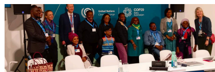
2024 United Nations Climate Change Conference

As climate change accelerates, the most vulnerable groups in Kenya, particularly persons with disabilities (PWDs), women, and children, face disproportionate challenges. However, through the Global Disability Caucus, efforts are intensifying to include PWDs as active agents of change in climate action.