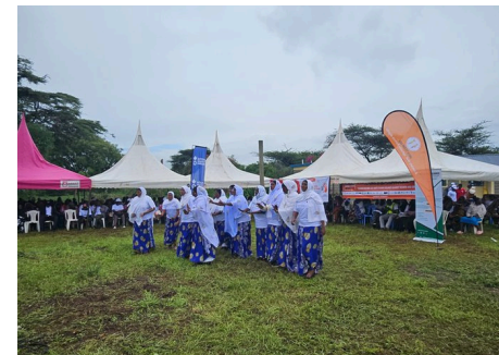
A group of women joyfully participate in a vibrant performance to commemorate the 16 Days

Commissioner Lentumpuru summed up the spirit of the day with a hopeful message: "This is not just a campaign; it is a movement. Together, we can end gender-based violence and ensure a brighter, equitable future for all."