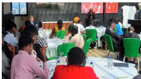
Engaged and attentive: Youth actively participate in a dynamic stakeholder meeting

Bringing together students from leading institutions like the University of Nairobi, JKUAT, and Kenyatta University, the meeting provided a platform for thought leaders and innovators to explore the policy landscape, technological advancements, and youth-led innovations in the sector.