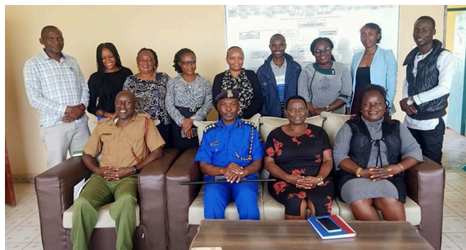
Stakeholders from Kitui West pose for a group photo during a consultative meeting

In a powerful show of unity and commitment, the Kitui Regional Office joined the first planning meeting for the 2024