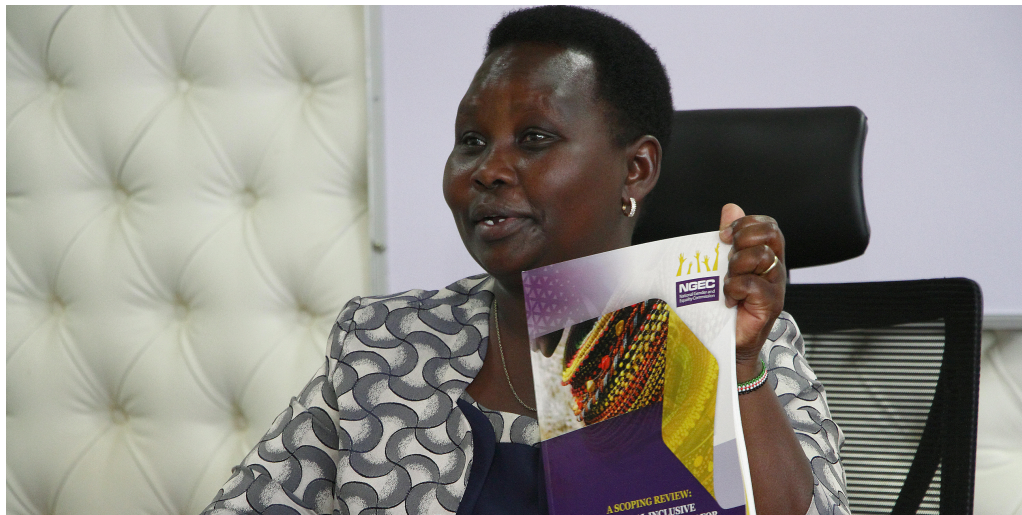
Commissioner Caroline Lentupuru engages stakeholders during a roundtable discussion

"We are building a stronger Kenya when we ensure that no one is left behind," said Commissioner Caroline Lentupuru in her opening remarks. "This framework will serve as a blueprint for an inclusive Kenya, where all citizens, regardless of their background or status, have access to opportunities and the tools needed for a brighter future."