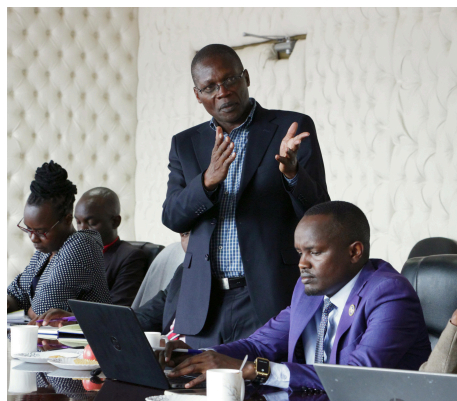
Stakeholders engage in a roundtable discussion focused on developing a National Framework for the Inclusion of Marginalized Communities

The roundtable discussions focused on how best to ensure that marginalized communities, including women, youth, persons with disabilities (PWDs), and other minority groups, receive the support and representation they deserve. With input from community leaders, civil society organizations, and government officials, the conversations were designed to set the groundwork for policies that will foster an inclusive society for all Kenyans.