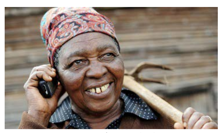
Kenyan woman farmer on the phone