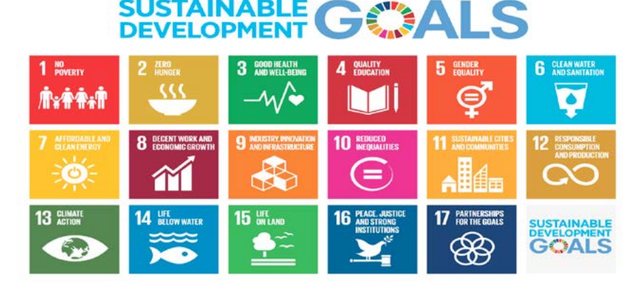
Sustainable Development Goals