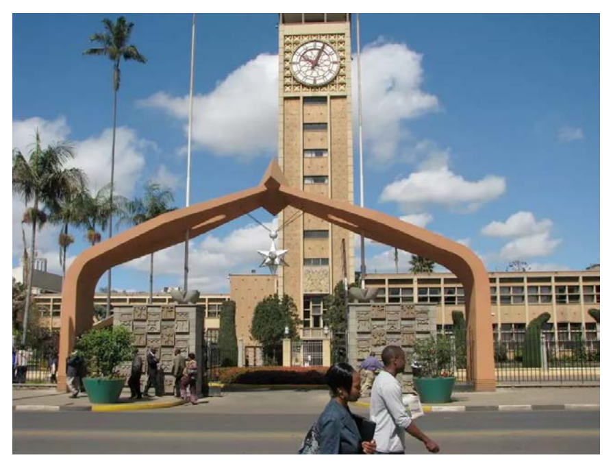
Parliament Buildings, Nairobi