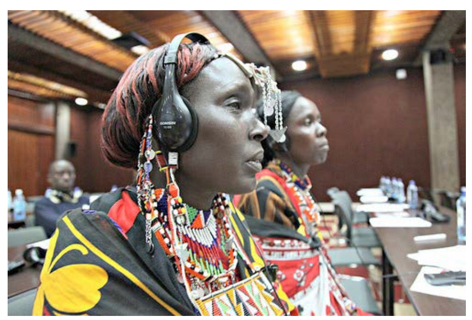
Maasai women attending a conference