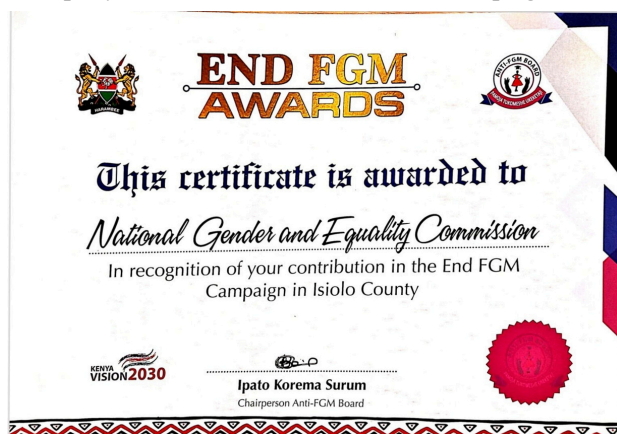
Certificate in recognition of NGEC's unwavering commitment to public education on ending FGM.