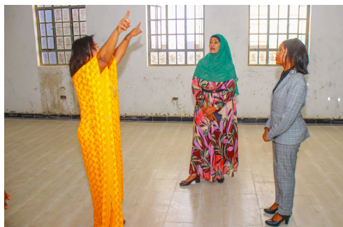
Nairobi County Woman Representative, Hon. Esther Passaris, and NGEK Chairperson, Hon. Jaldesa, inspect the ongoing construction of Nairobi County's first-of-its-kind safe house

Speaking at the site, Hon. Jaldesa emphasised the Commission's unwavering commitment to working with Nairobi City County and other key stakeholders to strengthen protections for survivors and address the root causes of GBV.