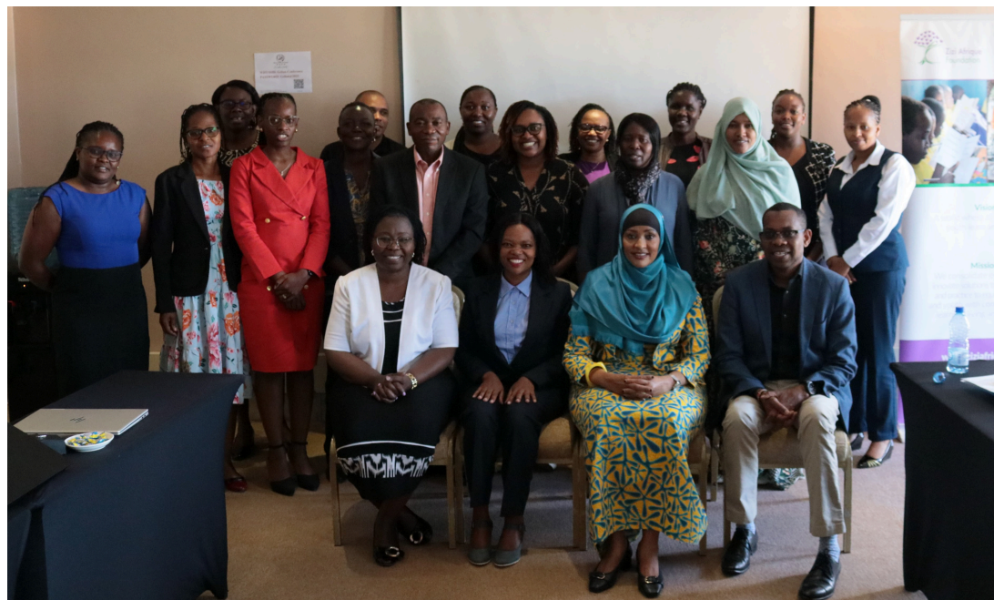
The Chairperson and stakeholders pose for a group photograph at the Equality Data Hub Co-Creation Workshop in Machakos

At the heart of this initiative is the establishment of a Gender Equality & Inclusion (GEI) Data Hub, a pioneering platform designed to provide disaggregated data that will drive policy formulation and advocacy efforts.